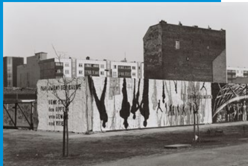
The Parliament of Trees 1992

Artist Ben Wagin first created the Parliament of Trees in 1991 when he began planting in the former Berlin Wall border strip across from the Reichstag. The site developed into a monument against war and violence, commemorating the victims of the Berlin Wall in the center of Berlin's government district.