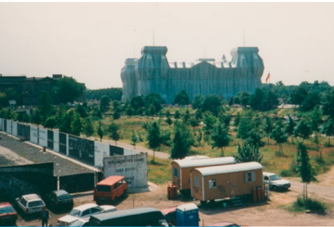
The Parliament of Trees and the shrouded Reichstag, 1995